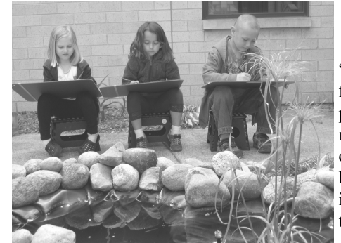
First graders draw the new pond during art class.